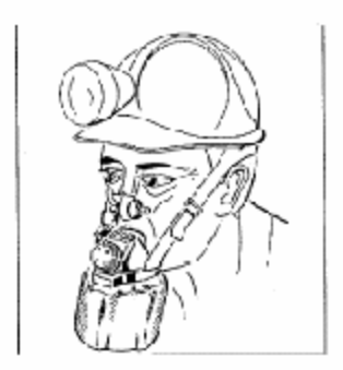
Fig 8: In case the FSR cannot be pulled out of its case (if, e.g. the case is badly dented), the FSR can still be used with the case bottom, however, with increased inhalation resistance.